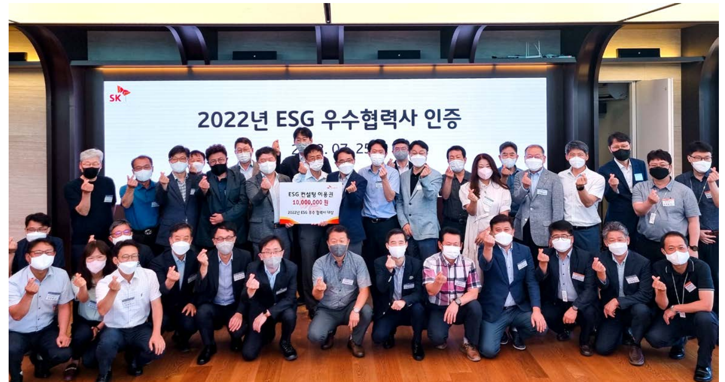
SK Innovation certifies excellent ESG suppliers in 2022.

SK Innovation certified and awarded suppliers with excellent ESG performance, based on the supplier ESG assessment in the previous year. In 2022, 25 suppliers were awarded an excellent ESG supplier certification and a voucher for ESG consulting.